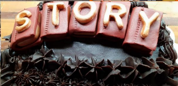
100th batch of the Beginner Course completion and Celebration